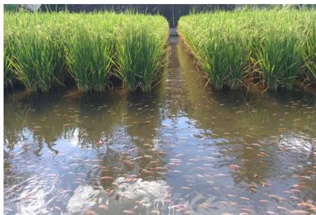
Figure 3: Rice-Fish Field (Kembangraps 2015)

This multifunctional water management system incorporates land, water and farming systems by providing a barrier against soil erosion, and also helps conserve irrigation water and paddy-cum fish cultures. Held by bamboos and wooden clips, dykes or bunds (0,6 m to 1,4 m wide and 0,2 to 0,6 m high) are erected in the fields to hold up the water level. To keep the soil as fertile as possible, ploughing is avoided (Nimachow et al. 2010). Millet is also irrigated on dry hilltops as part of dry cultivation (Agarwal & Narain 1997). The figure below shows a flooded rice-fish field.