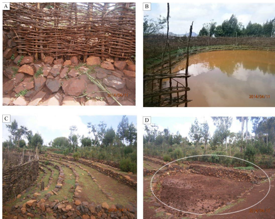
Figure 2: (a) A wooden mesh to sieve debris,(b) fenced pond, (c) preserving ponds from silt by constructing outside terraces, and (d) basins to collect silt coming in through the flood (Behailu, Pietilä & Katko 2016).

The people of Konso, Ethiopia engineered an impressive structure made from local materials to confine debris and silt. Through practice they realised that silt flowed in high velocity water, so they came up with structures to moderate the flow of water, before it reached its final point. The following picture shows contour bench terracing practiced in the steep mountainous regions (Behailu, Pietilä & Katko 2016).